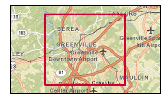
October 08, 2014